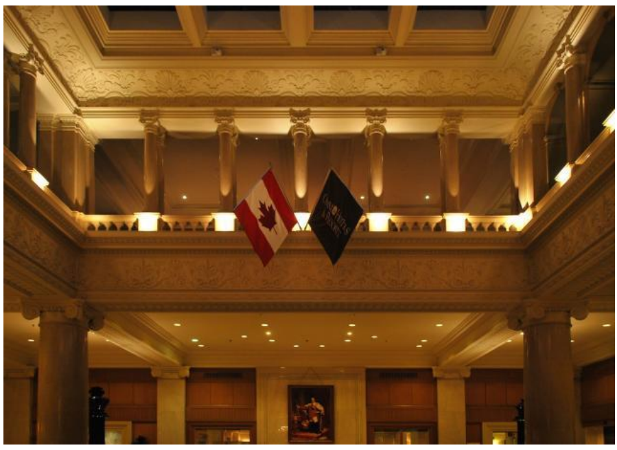
The hotel's lobby atrium

As of 2013, Omni Hotels and Resorts now manages the grand dame . They immediately started renovations of the 301 guest rooms, 22,000 square feet of meeting spaces and other common areas, completing the project this past June.