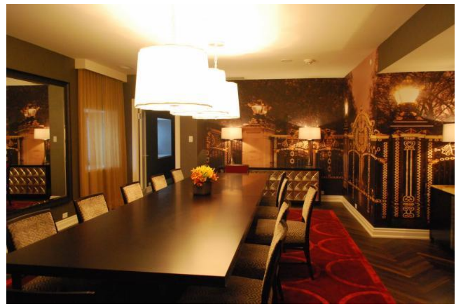
The Royal Suite's dining room

The hotel coexists with <u>private residences</u> located on the third, fourth and fifth floors, which <u>Skyline International</u> brought to market in 2012. Residents have access to the hotel's amenities, making for a seamless connection between guests and residents.