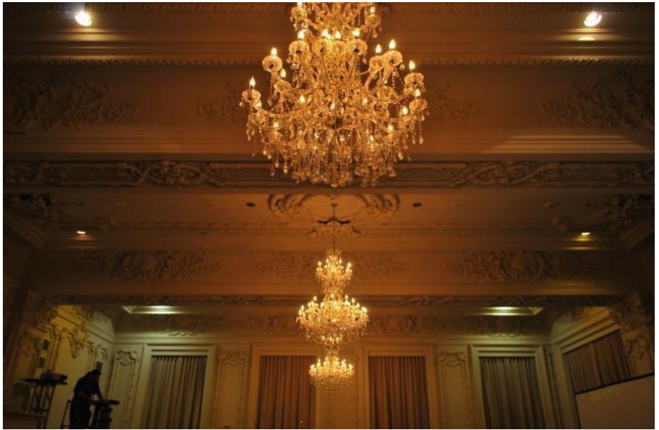
The Sovereign Ballroom

Three grand ballrooms were retrofitted during the process, including the ground floor Sovereign Ballroom pictured below. New chandeliers hang from the stunningly Edwardian-style ceiling as traditional afternoon tea is held below.