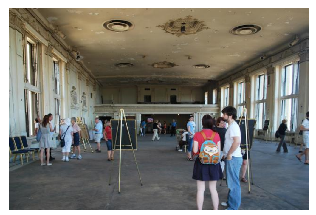
The Crystal Ballroom could regain its former glory

views of the city, the ballroom was shuttered in the 1950s following the implementation of new fire codes. The space has seldom been seen since then, but a glimpse during Doors Open in recent years revealed its rich potential.