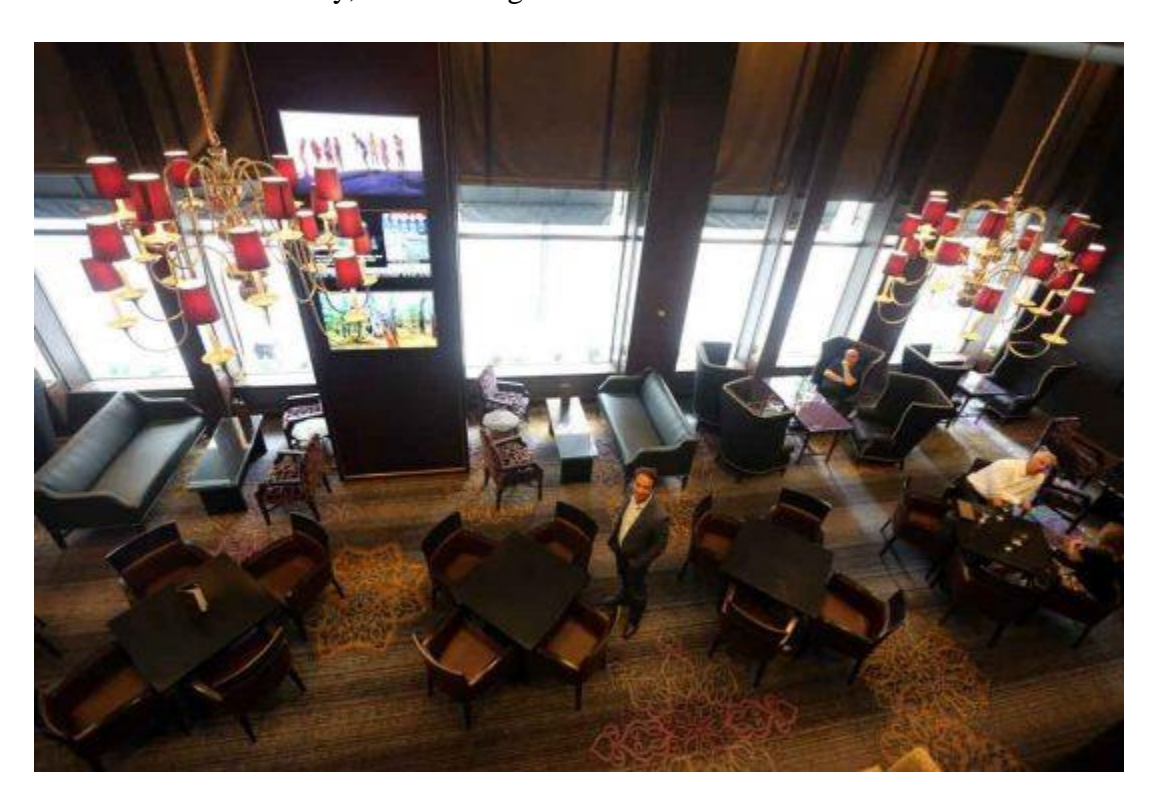
The Consort Bar's new look.

"We weren't trying to create something completely new, but to take the King Eddie, once the cultural heart of this city, to the next generation — to move it forward."