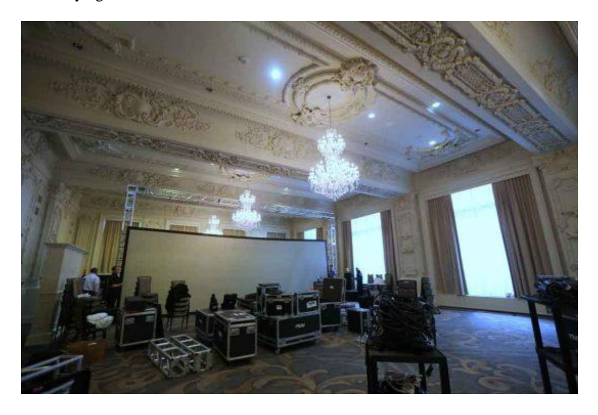
A look at the Sovereign ballroom, formally know as the Victoria ballroom.

A few months later, some 3,000 teenagers created a frenzy when they found out The Beatles were staying at there.