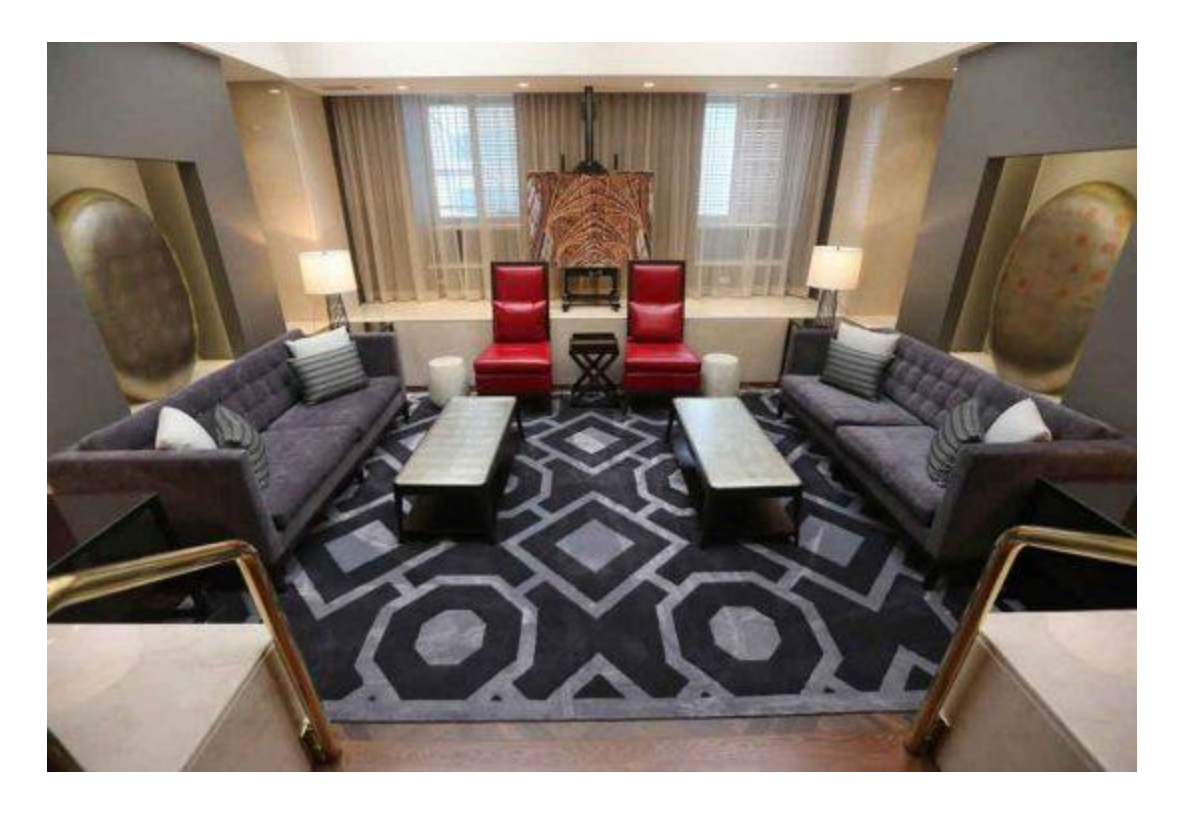
The modern-looking Royal Suite.